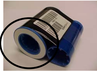
i Series Ribbon

The i Series designation is part of the ribbon description. i Series TrueColours™ ribbons are packaged in blue boxes and are clearly identified on ribbon packaging and labeling. In addition, all i Series ribbons part numbers are different from non- i Series ribbon part numbers.