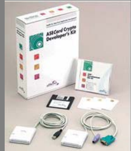
ASECard Crypto SDK

ASECard Crypto is based on ASEPCOS, Athena's most advanced smart card operating system. ASEPCOS is designed with the maximum level of security in mind. Its built-in security features, smart memory management, and large user memory, make it the perfect platform for PKI, Authentication, and Digital Signature solutions.